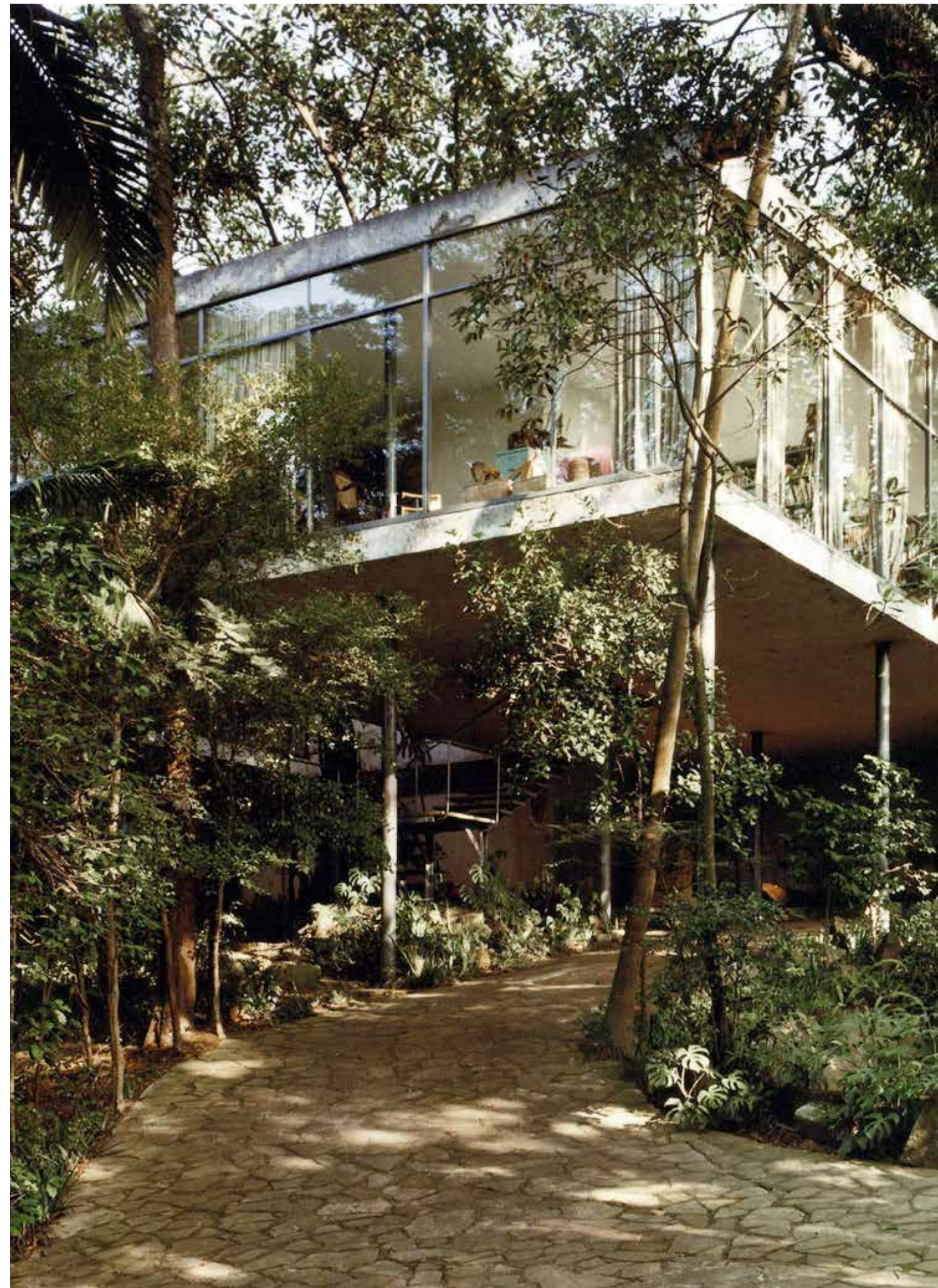
Lina Bo Bardi Glass House, São Paulo, Brasil.